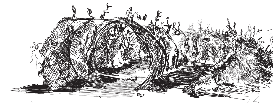
Beneath the surface/ dans la grotte