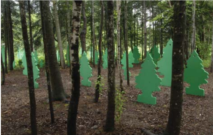
Passe-moi un sapin Rita by the Montreal threesome Rita, © Louise Tanguay

ingeniously transformed vestiges of previous gardens into a colourful viewing point.