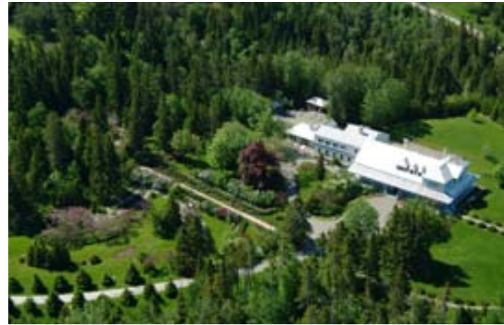
Estevan Lodge, Production Phosphoric

The summer of 2012 will be a double anniversary for the Gardens – the 50 th anniversary of the opening of the gardens to the public and the 125 th anniversary of the construction of Estevan Lodge. Preparations are underway for a series of celebratory events for 2012, a writing competition for local youth, a new exhibition in Estevan Lodge, reunions for former staff of the gardens, the creation of one or more extra-mural gardens in the region, the unveiling of a new work of art, the opening of a museum of garden tools and commemorative activities in June, July and August. Those interested in joining the Célébrations 2012 committee are invited to contact Alexander Reford.