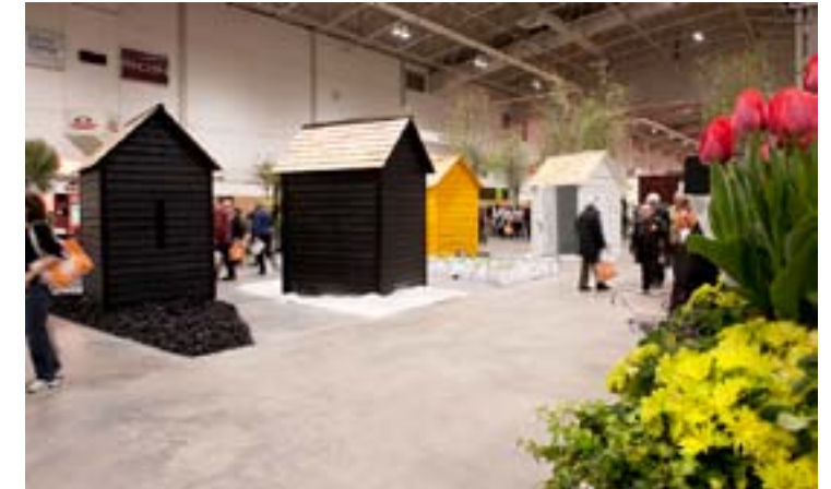
How green is the garden? presented at Canada Blooms in March