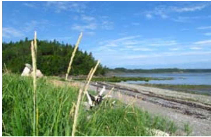
Sea Lyme Grass

In partnership with the Comité ZIP du Sud-de-l'Estuaire, the Gardens are leading efforts to combat coastal erosion with the production and planting of sea lyme grass in the region. Sea lyme grass is a native plant whose extensive root system helps to stabilize coastal zones. Under the supervision of Jean-Yves Roy, the gardens have produced 10,000 sea lyme grass plants in our new greenhouses. As many as 5,000 plants will be used to replant an area at the mouth of the river damaged by the waves and high tides of December 6. Plants are also being made available to environmental groups and individuals at a cost of $1 per plant. Financial support for this project has been received from the Telus Community Investment Fund, the RBC Blue Water Project and the MRC de La Mitis. The Comité ZIP du Sud-de-l'Estuaire will partner with the Gardens to educate local citizens about coastal erosion with a number of workshops and presentations over the summer. This year's annual community shoreline cleanup will be held on Saturday, June 4 at the Mitis River Park.